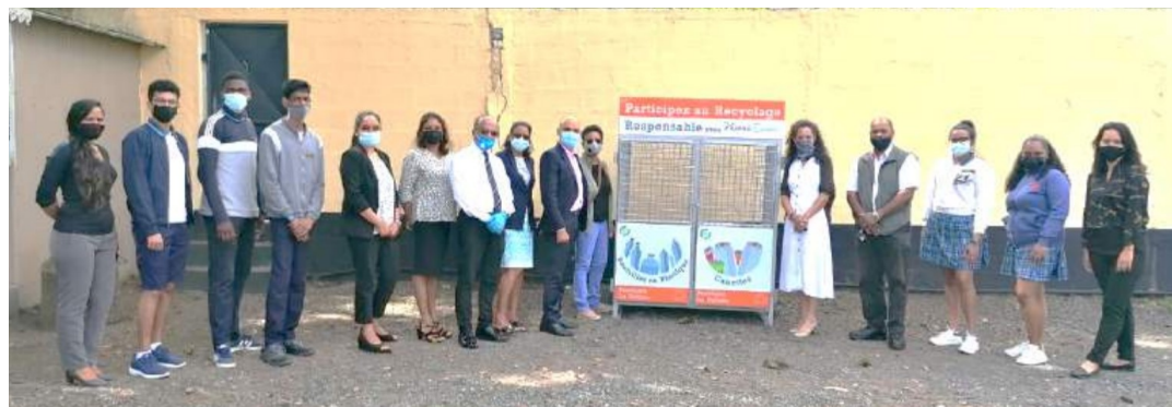
Recycling collection station at Adventist College

As such, a first recycling collection station was installed at the Bon et Perpetuel Secours (BPS) College in 2020. The other recycling collection stations were placed within the premises of Phoenix State Secondary School, Sir Abdool Rahman Osman (SARO) State Secondary School, Sodnac State Secondary School and Adventist College throughout 2021.