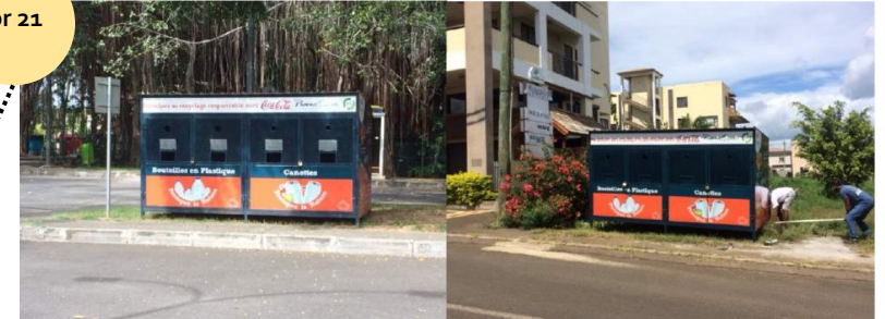
Albion public beach