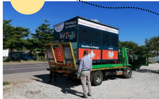
West Coast International Secondary School