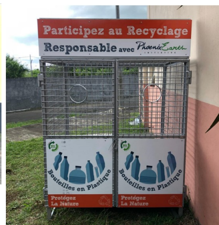
Recycling collection station at Sir Abdool Rahman Osman (SARO) SSS