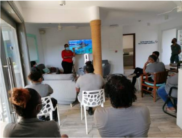
Training session at La Mariposa Boutique Hotel 3rd September 2021

Additionally, learning workshops were held for Mauritius Union and ENL Group in Moka.