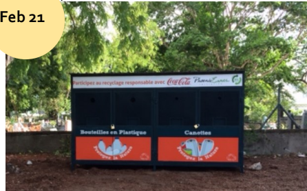
La Preneuse cemetery