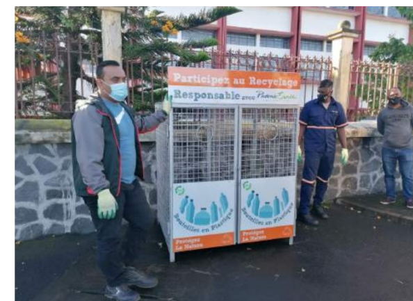
Recycling collection station at Sodnac SSS