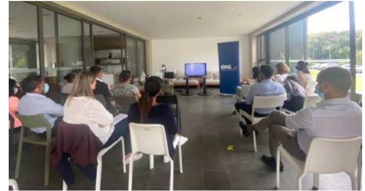
Training session at ENL House 23rd September 2021