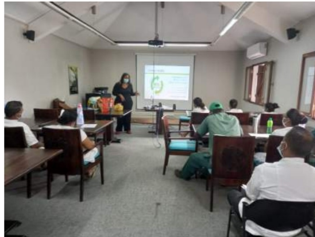
Training session at Lux Le Morne 8th September 2021