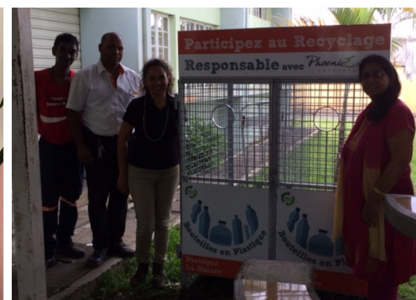
Recycling collection station at Phoenix SSS